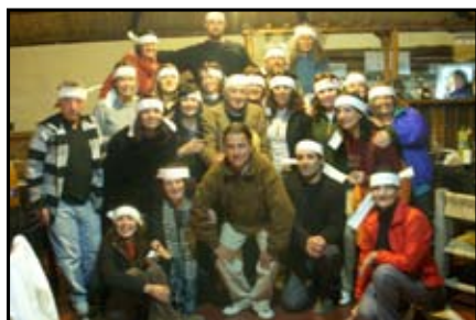
I handed our handmade trips with words about Servas purpose