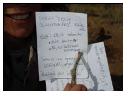
The statement we left with the flag