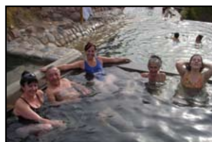
A group in the Cacheuta springwaters