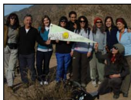
All the group