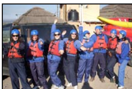
Rafting in the Mendoza river