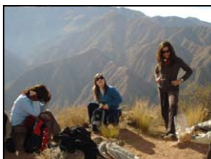
A stop on the way to the top