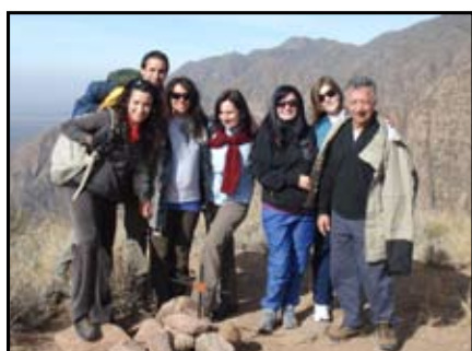
The group at the top of the cerro