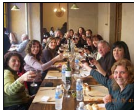
Asado in the organic vineyard