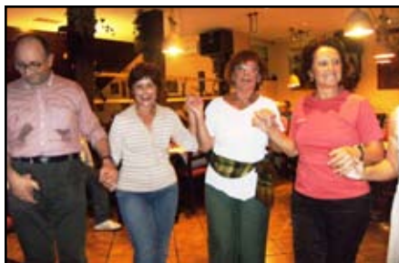
Dancing at the last Alpe Adria meeting, in Slovenia

In the past editions, most of participants come from Italy, Austria, Slovenia, Croatia, Hungary, and also from Switzerland, France, Germany, Belgium. Last year in Slovenia there were about 65 members from different countries.